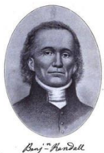
Benj m Randall

Benjamin Randall (February 7, 1749 – October 22, 1808) was converted during the Great Awakening as a result of the preaching ministry of George Whitfield. Rev. Randall served in the New Hampshire militia during the American Revolutionary War. The first Benjamin Randall biographer, quoted Rev. Randall's journal in recounting his conversion experience: