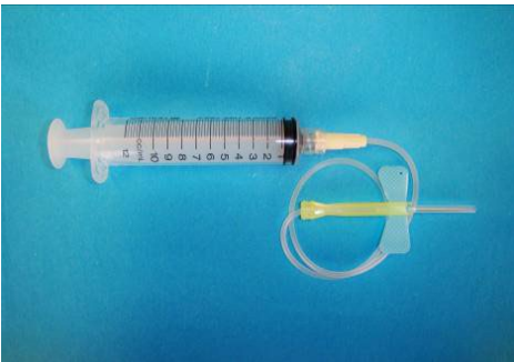
Combination of Butterfly and Syringe Systems

These facilities include spacious classrooms that include blood draw stations, fully equipped and designed for students to simulate on-the-job training. These stations can include phlebotomy chairs equipped with lock-in mechanisms to prevent falling and all necessary equipment and supplies required to perform phlebotomy procedures like antiseptic, gauze, Sharps container, tourniquets, vacutainer tubes, lancets, winged infusion sets, vacutainer needles and hubs, and personal protective equipment.