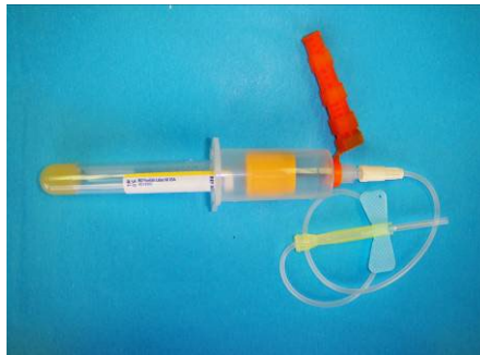
Combination of Butterfly and ETS System