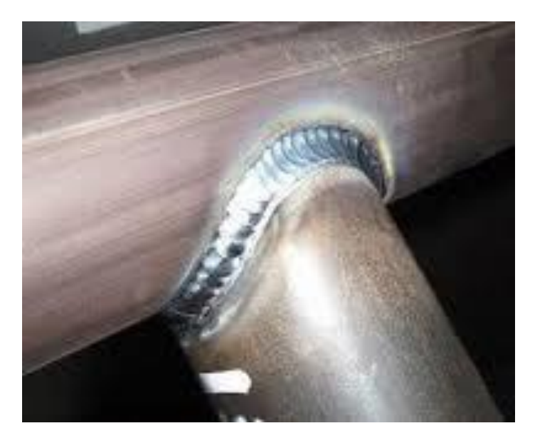
Figure 5: GTAW- TIG Pipe

Cost of courses are individually charged. Student is not obligated to attend all courses. If student decides to take all courses in sequence, the total charges for the entire educational program will be $14,737.50.