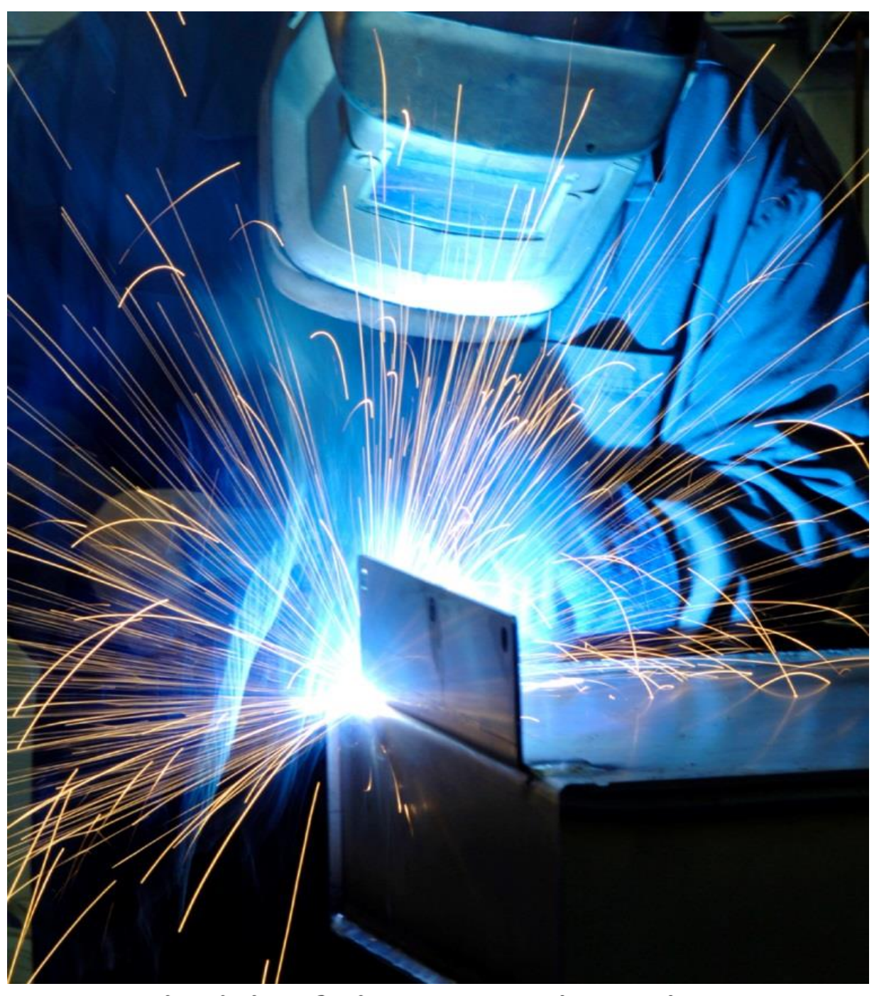
Schedule of Classes Vary by Cycle.

Please Call Southcoast Welding & Mfg. to Get More Information.