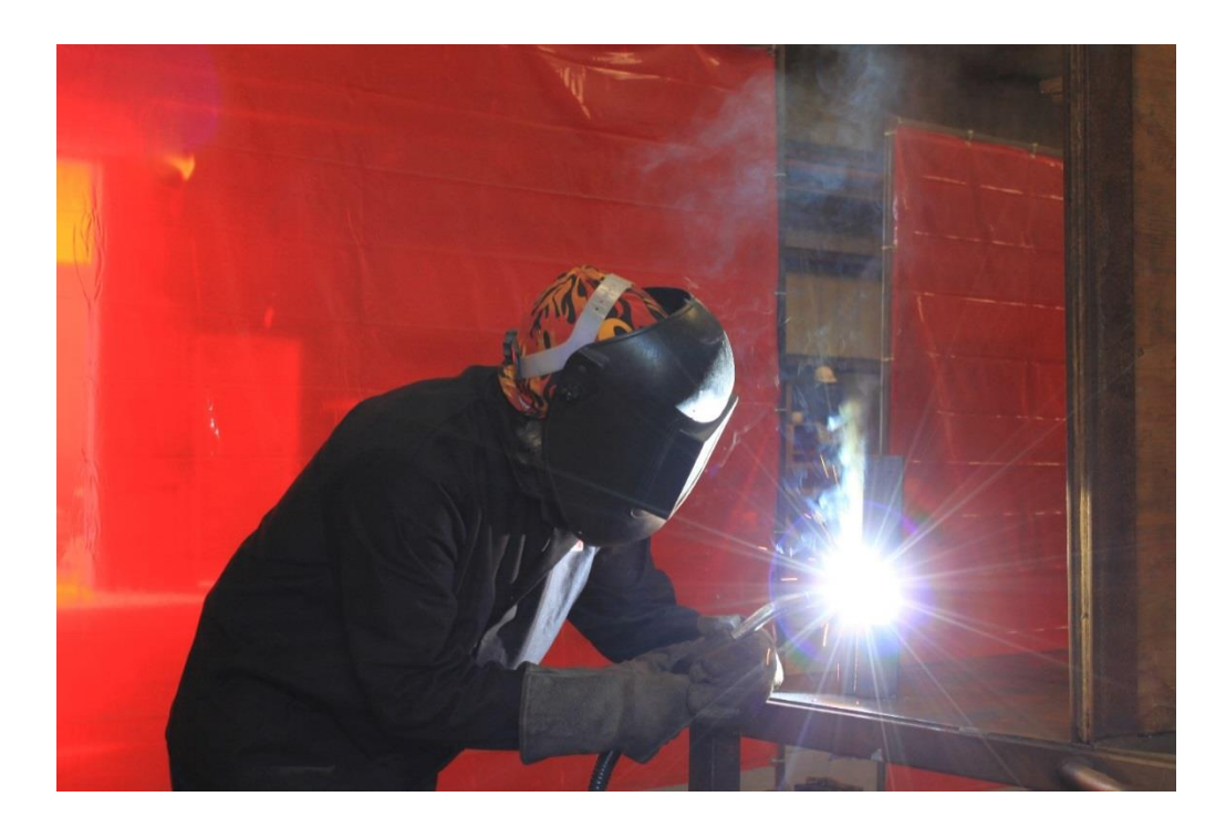
Figure 1: FCAW- Flux Cored