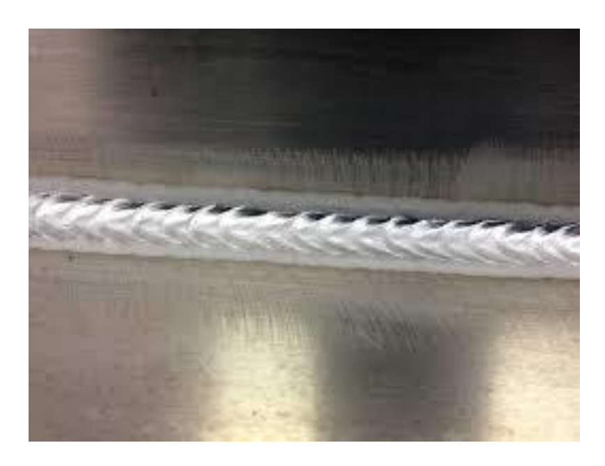
Figure 4: GMAW- MIG Advanced