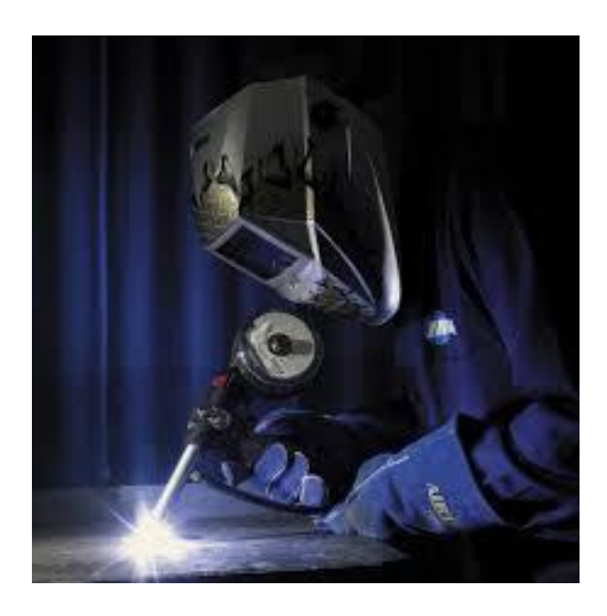
Figure 3: GMAW-MIG Aluminum

GMA003 Gas Metal Arc Welding (GMAW) – MIG Advanced Aluminum with 5XXX Requirements $2,205.00 Total and Estimated Charges for Period of Attendance and Entire Educational Program ($110.25 per scheduled day) *See "Charges: Tuition & Fees Pg. 7" for detailed program charges