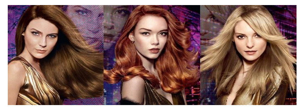
Hair Stylists Bring Color to the World

A student or any member of the public may file a complaint about this institution with the Bureau for Private Postsecondary Education by calling toll free (888) 370-7589 or by completing a complaint form, which can be obtained on the bureau's internet website <a href="https://www.bppe.ca.gov">www.bppe.ca.gov</a>.