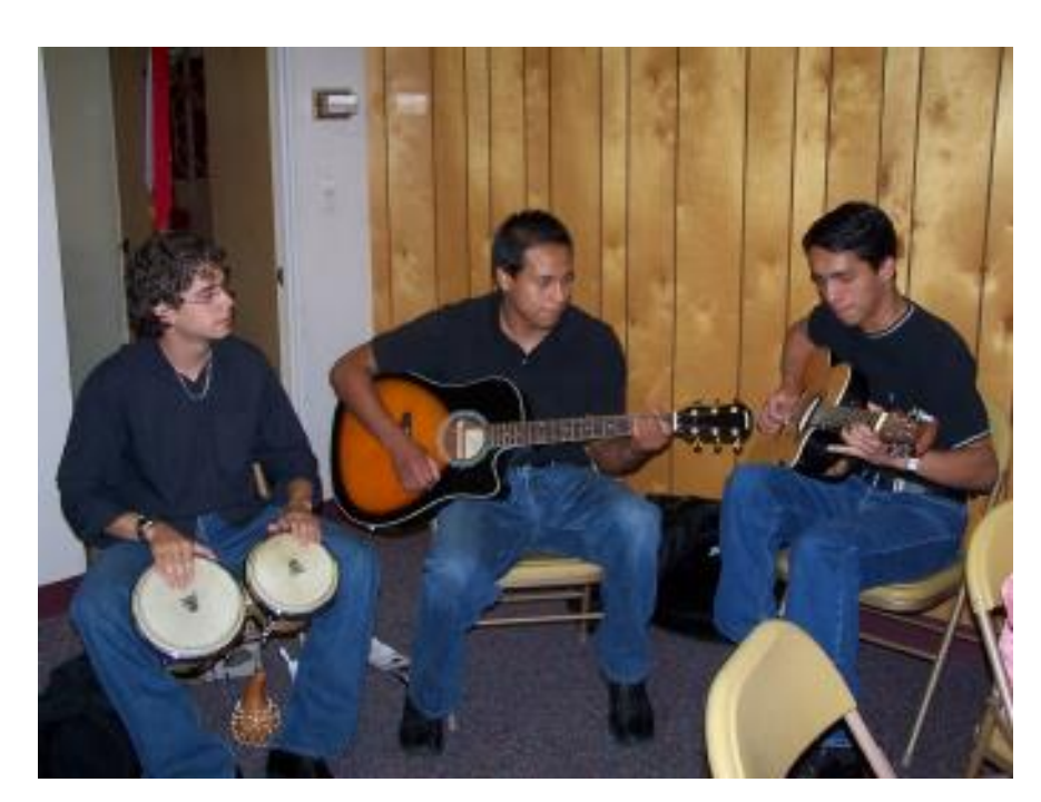
Final Presentation for Humanities 110