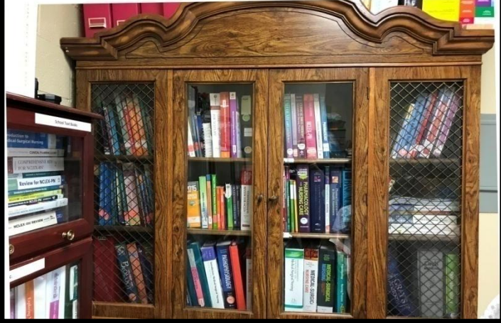
Figures 8-9: Library