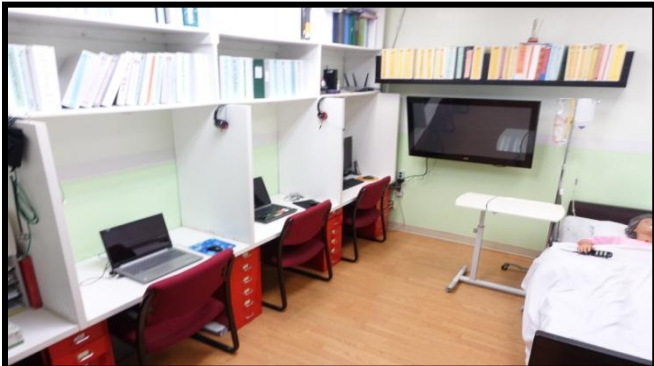
Figures 4-5: Room 209 Computer Lab