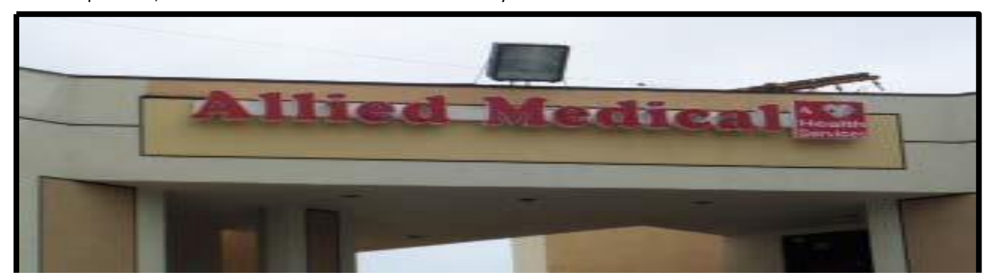
Figure 1 Façade: Allied Medical & Health Svs., Inc. Signage on 730 S. Central Ave, Glendale CA 91204.

1. PHYSICAL FACILITIES: Classroom at Room 208 is 550 sq ft. Maximum capacity of 30 persons, 30 chairs and 18 tables with a seating capacity of 35. One table for faculty, chalkboard (46" x 28"), TV/VCR/DVD and space available for hospital bed, in case of demonstration or other laboratory works.