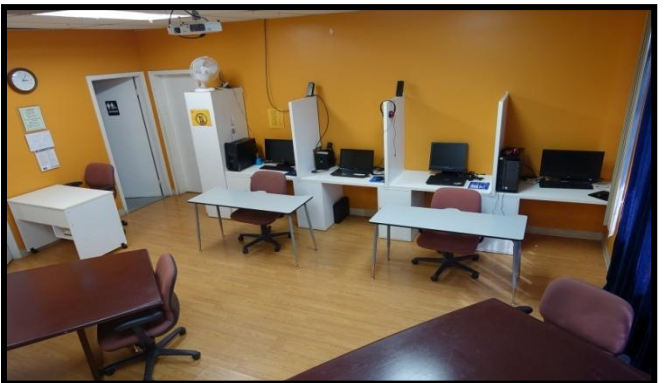
Figure 3: Room 208 Tables & Computer Stations