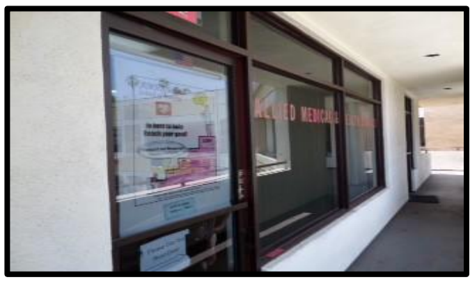
Figure 10: Room 208/209 Corridor