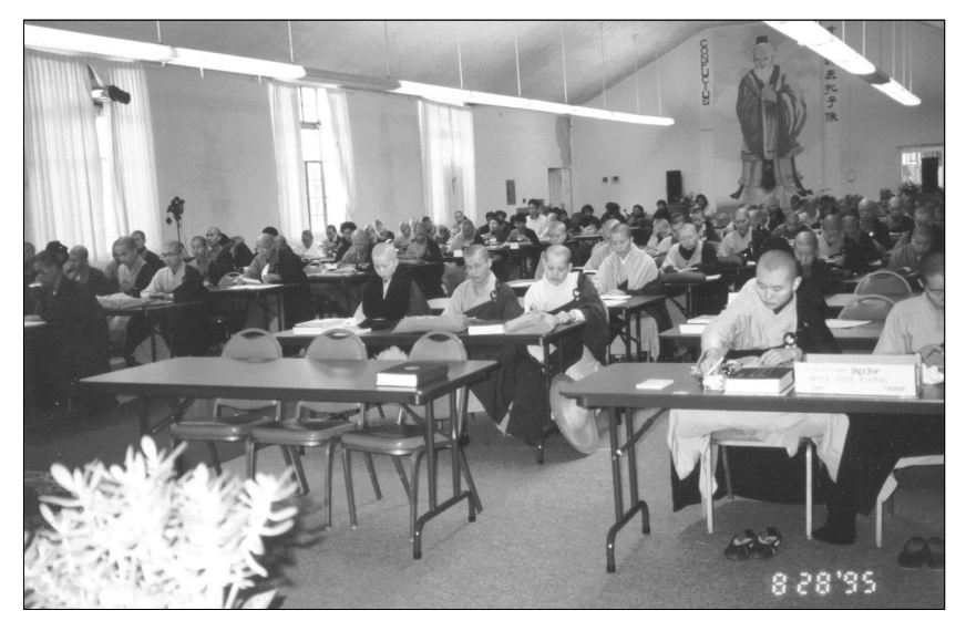
Vinaya class being held in the Dao Yuan (Source of the Way) Hall, City of Ten Thousand Buddhas.

This area provides qualified students in their fourth year of study the opportunity to apprentice in diverse aspects of monastic administration and community service. This may include classroom teaching-assistant training; learning to make curriculum aids and teaching materials; training in the management of worship halls, dormitories, libraries, and religious centers, such as temples, translation institutes, educational facilities, and retreat locations; greeting, providing for, and handling matters for guests; directing reception centers, and administering delegations and special events; counseling elementary and high school students; and offering programs that provide companionship, physical care, and moral support for the elderly. Students are assigned counselors, and each student conducts his or her training under the supervision of at least one certified instructor. Students may choose to conduct their apprenticeship on campus, or at a DRBA-authorized religious center.