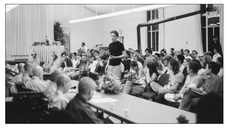
Visiting students direct questions to a panel of monks and nuns during a weekend retreat.