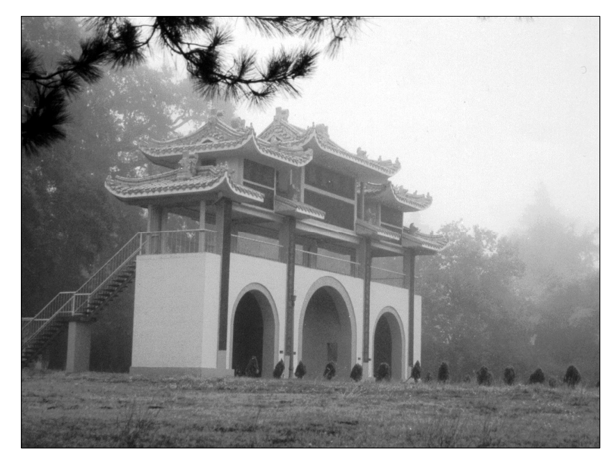
Entrance to the City of Ten Thousand Buddhas.