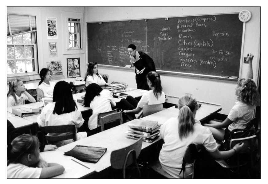
Developing Virtue Girls' School students during an in-class discussion led by an ordained nun.

Instilling Goodness Elementary School and Developing Virtue Secondary School, have been operating at the City of Ten Thousand Buddhas since 1973 and 1976 respectively. The Association also sponsors intensive retreats and meditation sessions; daily lectures on the Buddhist Sutras; and, periodic ordinations of Bhikshus and Bhikshunis (monks and nuns) into the orthodox Buddhist Sangha. The Association publishes the Buddhist monthly journal, Vajra Bodhi Sea.