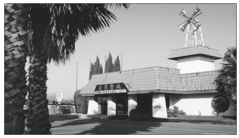
Entrance to the worship hall, City of the Dharma Realm, West Sacramento.