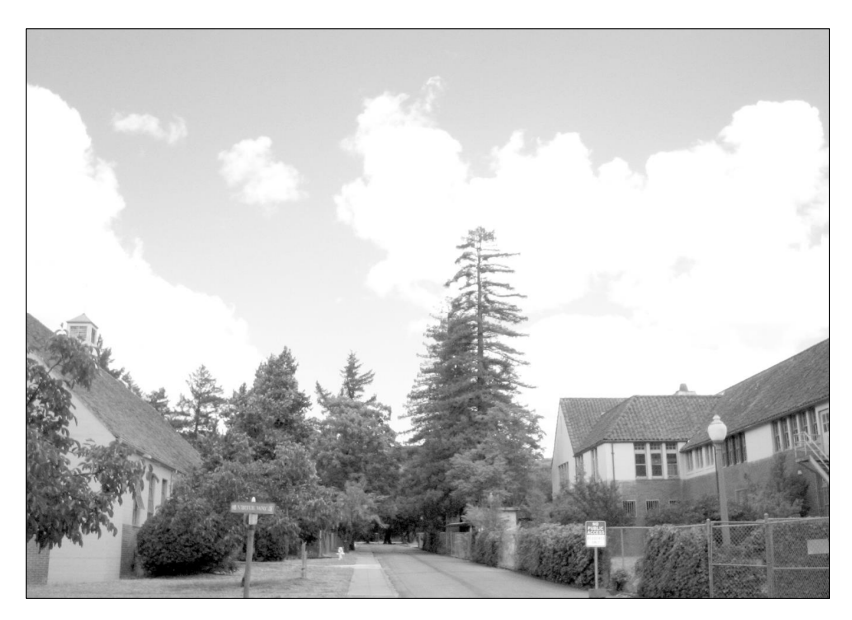
View of Wordless Hall and road towards Wonderful Enlightened Mountain.