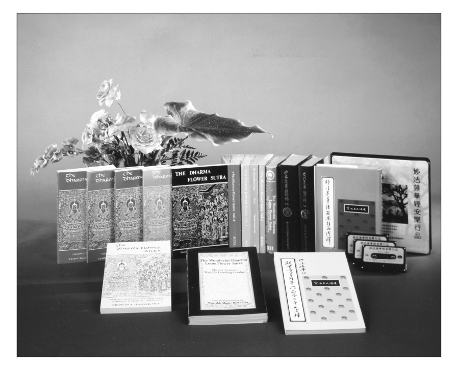
Books and Audio Tapes Published by the Buddhist Text Translation Society.

Recommended Readings: To be arranged by instructor.