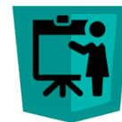
Portfolio of Projects