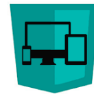
Modern Layouts & Mobile Design