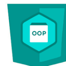
Object Oriented Programming