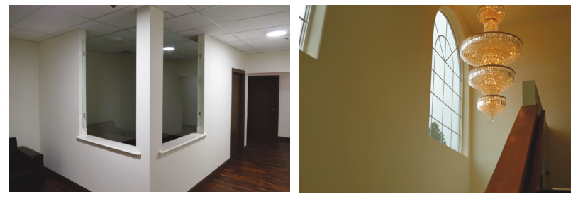
From top: Auditorium, Common Room, (left) Registrar's Office, Atrium and Chandelier over Seminary Entrance and Staircase