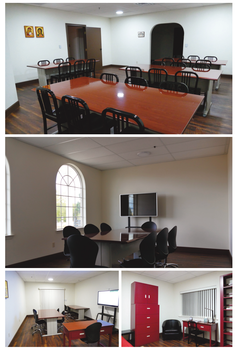
From Top: Cafeteria, Seminar Room, (left) Typical Classroom, Typical Student Dormitory Room (Single)