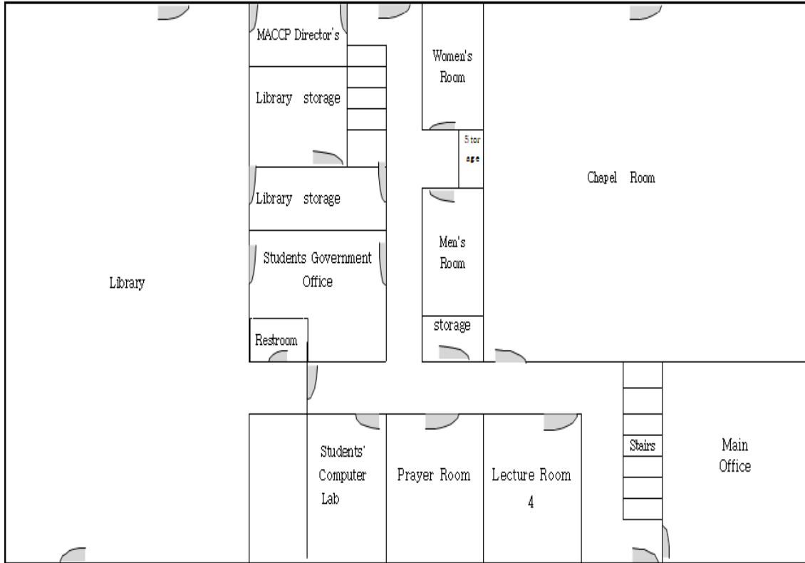
<Carmenita Building 1st floor>