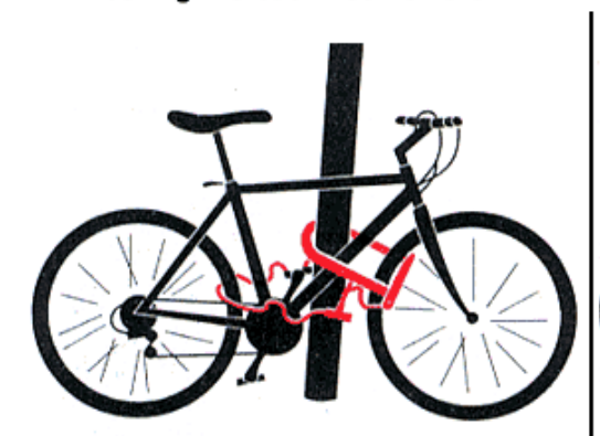
Position your bike frame and wheels so that you fill up or take up as much of the open space within the lock's U portion as possible. The tighter the lock up, the harder it will be for a thief to insert a pry bar and pry open your lock. Notice here that 2 different locks are used.