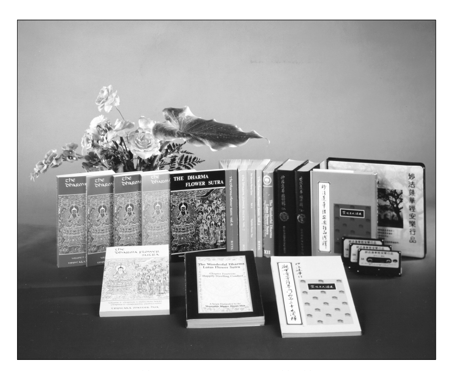
Books and Audio Tapes Published by the Buddhist Text Translation Society.

Recommended Readings: To be arranged by instructor.