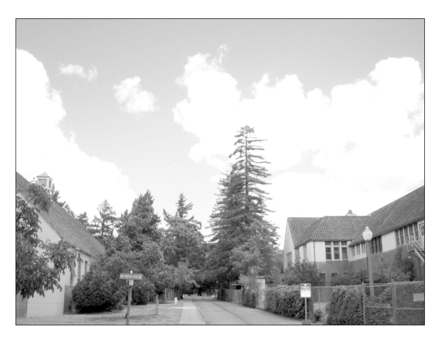
View of Wordless Hall and road towards Wonderful Enlightened Mountain.