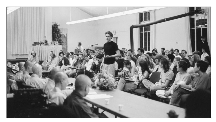
Visiting students direct questions to a panel of monks and nuns during a weekend retreat.