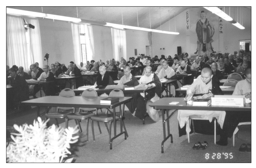
Vinaya class being held in the Dao Yuan (Source of the Way) Hall, City of Ten Thousand Buddhas.

This area provides qualified students in their fourth year of study the opportunity to apprentice in diverse aspects of monastic administration and community service. This may include classroom teaching-assistant training; learning to make curriculum aids and teaching materials; training in the management of worship halls, dormitories, libraries, and religious centers, such as temples, translation institutes, educational facilities, and retreat locations; greeting, providing for, and handling matters for guests; directing reception centers, and administering delegations and special events; counseling elementary and high school students; and offering programs that provide companionship, physical care, and moral support for the elderly. Students are assigned counselors, and each student conducts his or her training under the supervision of at least one certified instructor. Students may choose to conduct their apprenticeship on campus, or at a DRBA-authorized religious center.