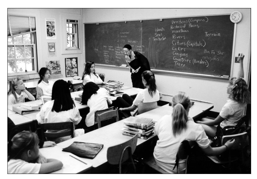
Developing Virtue Girls' School students during an in-class discussion led by an ordained nun.

Instilling Goodness Elementary School and Developing Virtue Secondary School, have been operating at the City of Ten Thousand Buddhas since 1973 and 1976 respectively. The Association also sponsors intensive retreats and meditation sessions; daily lectures on the Buddhist Sutras; and, periodic ordinations of Bhikshus and Bhikshunis (monks and nuns) into the orthodox Buddhist Sangha. The Association publishes the Buddhist monthly journal, Vajra Bodhi Sea.