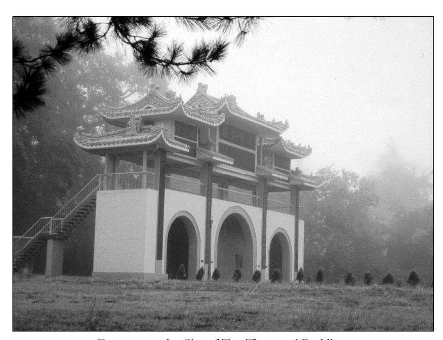
Entrance to the City of Ten Thousand Buddhas.