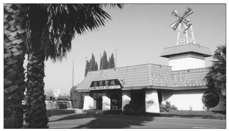
Entrance to the worship hall, City of the Dharma Realm, West Sacramento.