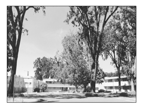
Tower of Blessings Home for the Elderly and CTTB Medical & Dental clinics.

The Sangha & Laity Training Programs are authorized by the U.S. Department of Immigration and Customs Enforcement [ICE] to admit non-immigrant foreign students. The Registrar's Department will provide information and an I-20 application for a foreign student visa [F-1] at no cost to the student; however, the student will be responsible for the costs of their own visa filing fees and postage. SLTP does not admit undocumented students. It is expected that graduates of SLTP will return to their own countries to pursue their vocations; moreover, student visas do not lead to permanent residency in the United States.