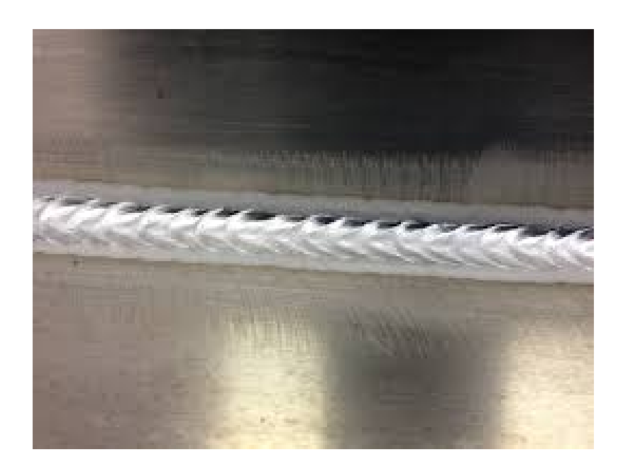
Figure 4: GMAW- MIG Advanced