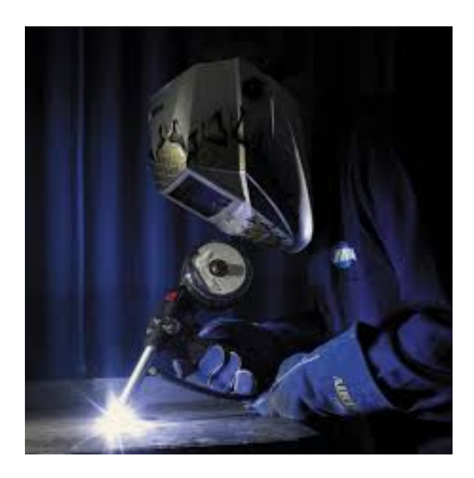
Figure 3: GMAW-MIG Aluminum

GMA003 Gas Metal Arc Welding (GMAW) – MIG Advanced Aluminum with 5XXX Requirements $1,800.00 Total Charges for Period of Attendance ($90.00 per scheduled day)