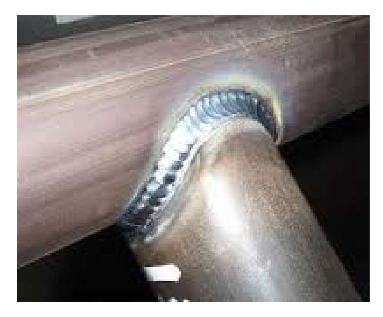
Figure 5: GTAW- TIG Pipe

Cost of courses are individually charged. Student is not obligated to attend all courses. If student decides to take all courses in sequence, the total charges for the entire educational program will be $11,900.00