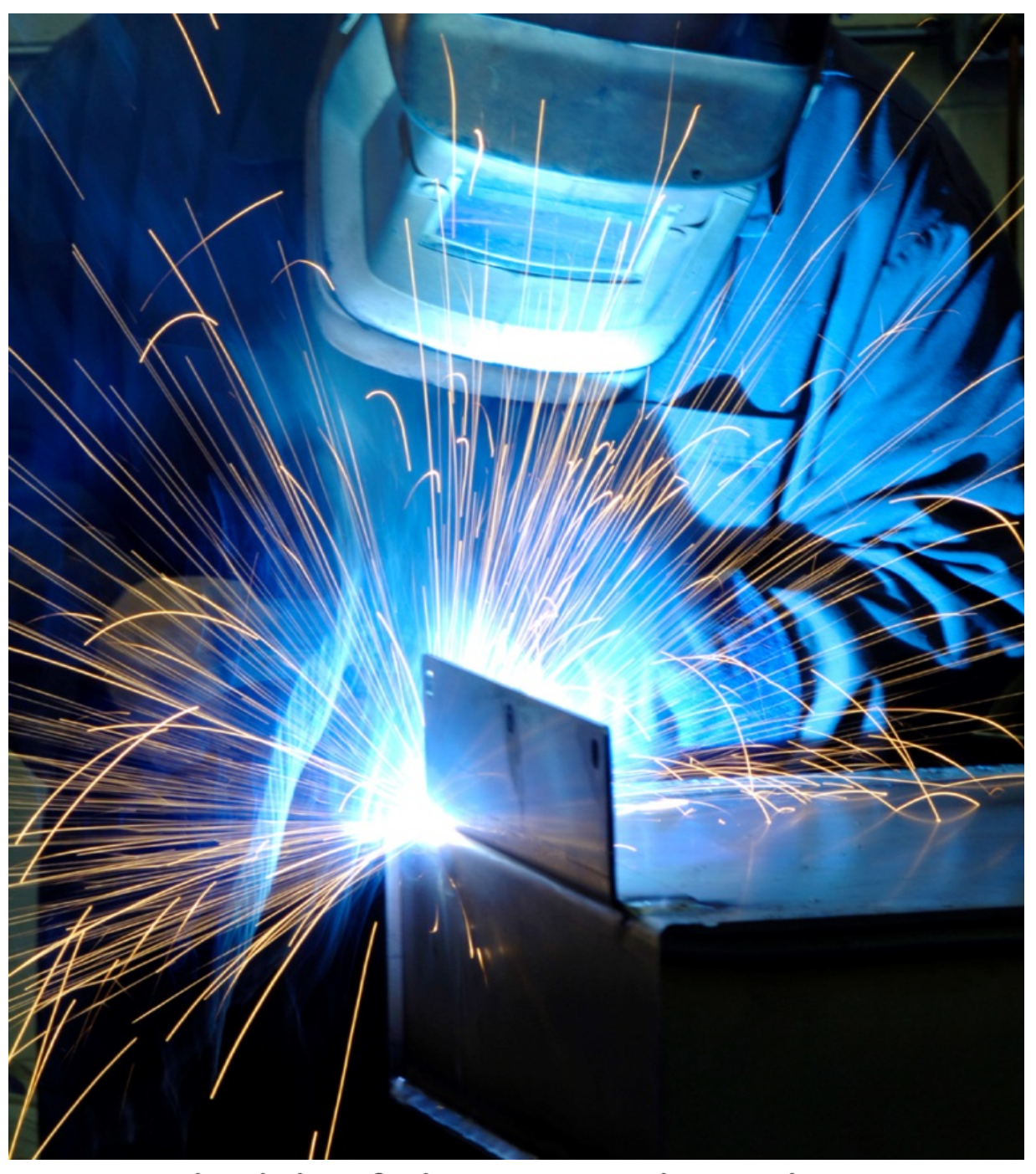
Schedule of Classes Vary by Cycle.

Please Call Southcoast Welding & Mfg. to Get More Information.