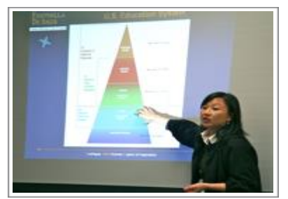
De Anza/Foothill College Visits AAE