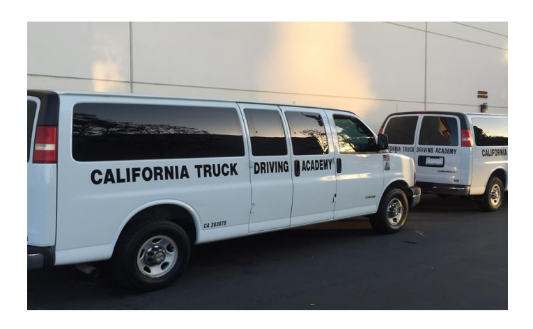
Class B Passenger without Airbrakes