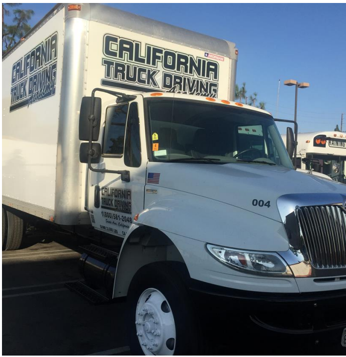
Class B Truck Driver